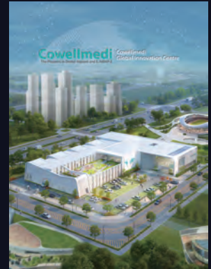
Global Innovation Centre Cowellmedi Global Innovation Centre has been completed in Busan, Korea

A CE-marked, non-resorbable barrier membrane with titanium reinforcement between PTFE layers