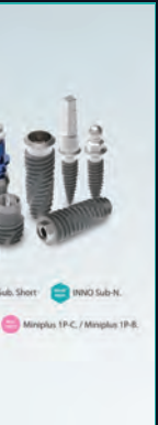
Sub. Short INNO Sub-N. Miraplus 1P.C. / Miraplus 1P.B.