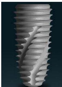
Figure 1 INNO™ implant which has the upper straight and lower tapered portions.

able to tolerate conventional surgical and restorative procedures. The exclusion criteria were the following: (1) active infection in the sites selected for implant placement; (2) systemic diseases, such as diabetes without control; (3) pregnancy; and (4) severe bruxism